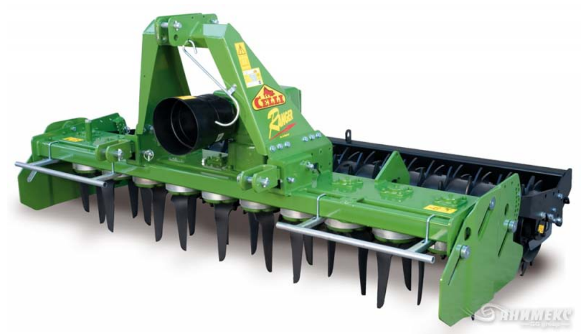
Fig.5 An active harrow with a vertical pivot

Using this type of ploughs ensures the destruction of weeds and the storing and preserving of moisture in the soil. It serves as a good preparation for the next operations of tillage and the final result is a texture of the soil that is very close to the garden state. After the plouing-in, machines with disc operating tools as well as combined machines for soil cultivation with cutting and scarifying tools can be used. They can be combined with roller crushers again. If it is possible, combined machines should be used. A possible version of tillage is to apply an active harrow with a vertical pivot and a roller crusher mounted on it after the ploughing-in (Fig. 5). Thus it is possible to achieve a garden-like texture of the soil with one drive only. This technology is the most energy consuming but it ensures the optimal quality.