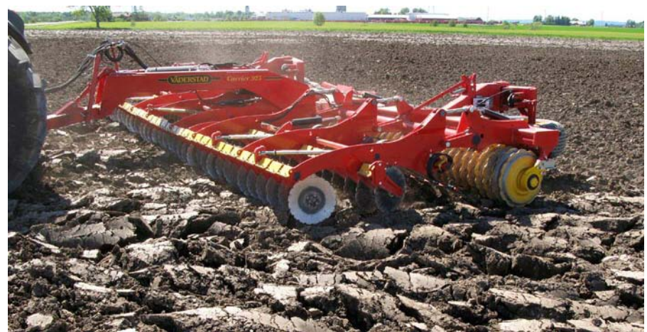
Fig.2 A disc cultivator with a toothed roller

In addition, instead of these types of rollers, toothed roller crushers in a welded construction can be used (Fig. 2). It is recommended for the disc tools of these machines to be designed with a smaller diameter of 330 - 350 mm so that smaller clods are formed. Toothed roller crushers additionally scarify and loosen the soil and at the same time they ensure an even seeding at a smaller depth and reduce the evaporation of the moisture from the soil.