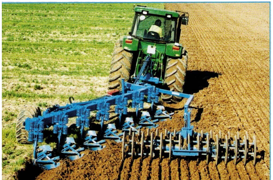
Fig.4 A plough equipped with a clod-breaker

Using this type of ploughs ensures the destruction of weeds and the storing and preserving of moisture in the soil. It serves as a good preparation for the next operations of tillage and the final result is a texture of the soil that is very close to the garden state. After the plouing-in, machines with disc operating tools as well as combined machines for soil cultivation with cutting and scarifying tools can be used. They can be combined with roller crushers again. If it is possible, combined machines should be used. A possible version of tillage is to apply an active harrow with a vertical pivot and a roller crusher mounted on it after the ploughing-in (Fig. 5). Thus it is possible to achieve a garden-like texture of the soil with one drive only. This technology is the most energy consuming but it ensures the optimal quality.